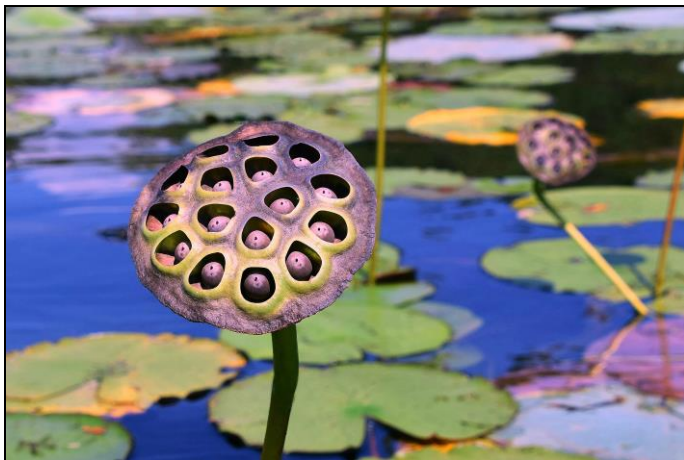
Otherworldly-looking, but beautiful Golden Lotus seed pods on the paddle to the Santee Canal.