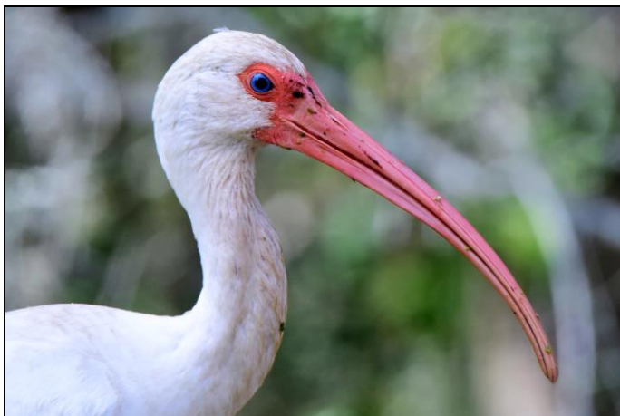
Ibis on the eastern shore of North Moultrie, right outside of the Santee Canal.