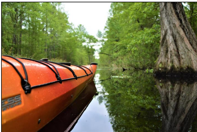
The quiet waters of the narrow Santee Canal.