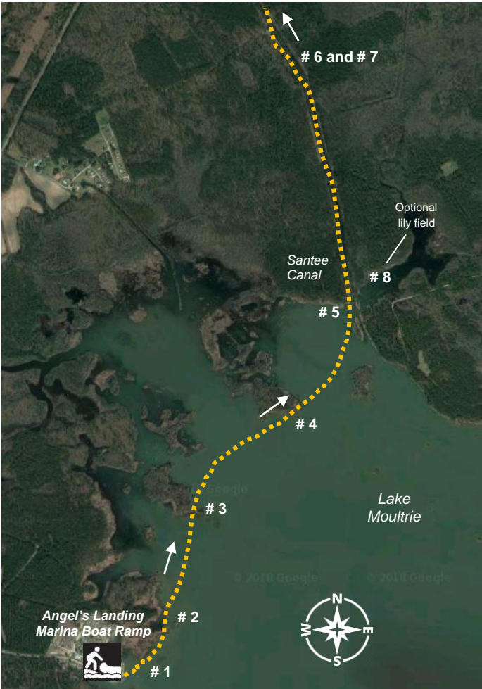
This map corresponds with route directions numbered 1 - 8 on page 6.