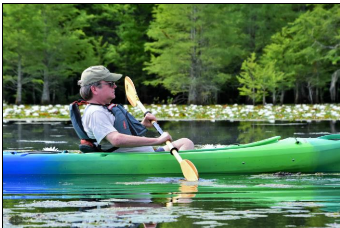
You'll paddle by acres of lily fields in the warmer months.