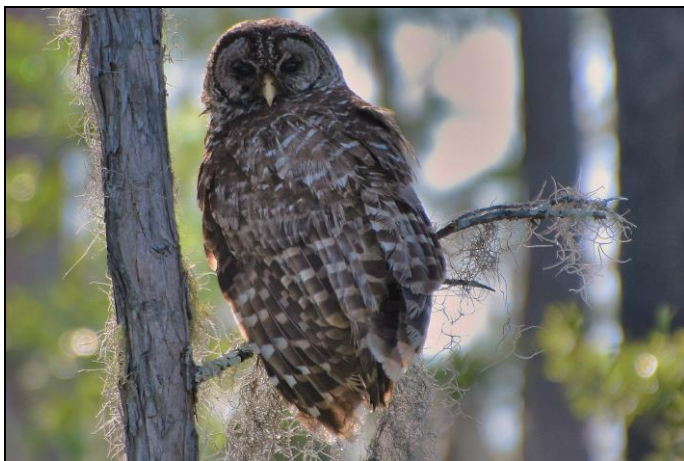
Barred Owl in Dennis's Pasture near the dike system on Lake Moultrie.