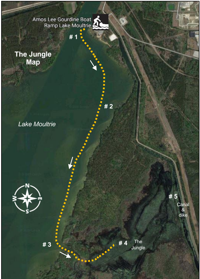
This map corresponds with route directions numbered 1 - 5 on page 6.