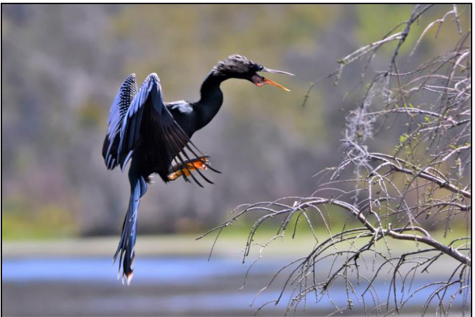
Male Anhinga near Sandy Beach on North Lake Moultrie.