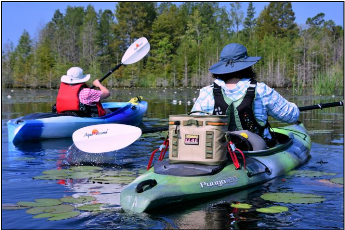
Paddling North Lake Moultrie to Sandy Beach.