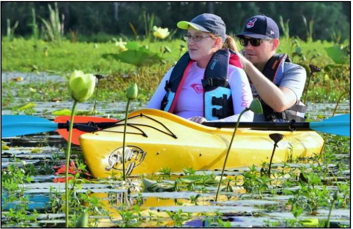
There's lots to see on the eastern shore of Lake Moultrie on this paddle.